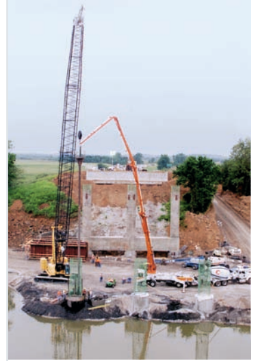
Improved pumpability can be achieved with PozzMod Plus.