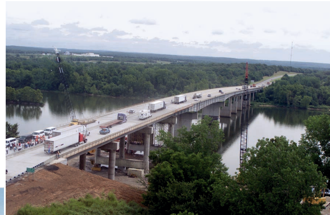
Demanding construction schedules can be met using PozzMod Plus.