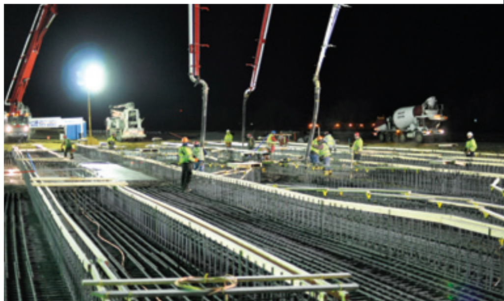
Four pumps placed the concrete, starting in the center and moving out to all four outside corners of the wall. Thermocouples were embedded to continuously monitor core temperatures.

Supplying a steady stream of this much concrete required five batch plants belonging to the three ready-mix pro-