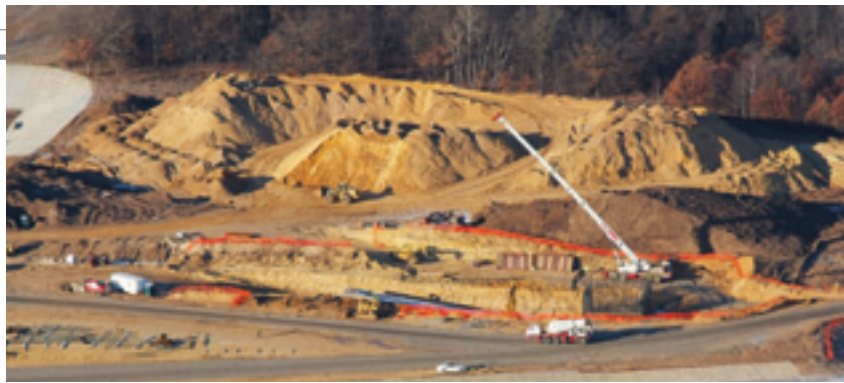
A special type of sand is mined in the town of Howard, Wis., which will be processed at the Chippewa Falls plant. Called frac sand, it helps energy companies extract more oil and natural gas.

onsite continuously tested temperature, slump, and air.